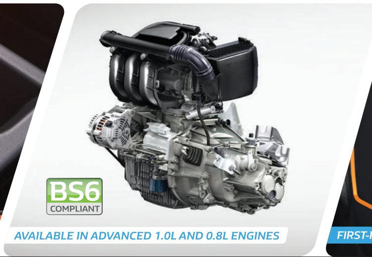
AVAILABLE IN ADVANCED 1.0L AND 0.8L ENGINES