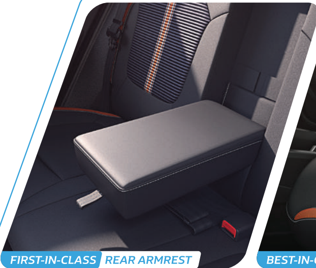
FIRST-IN-CLASS REAR ARMREST

*Sporty orange accents available in Climber (O) MT and AMT versions only.