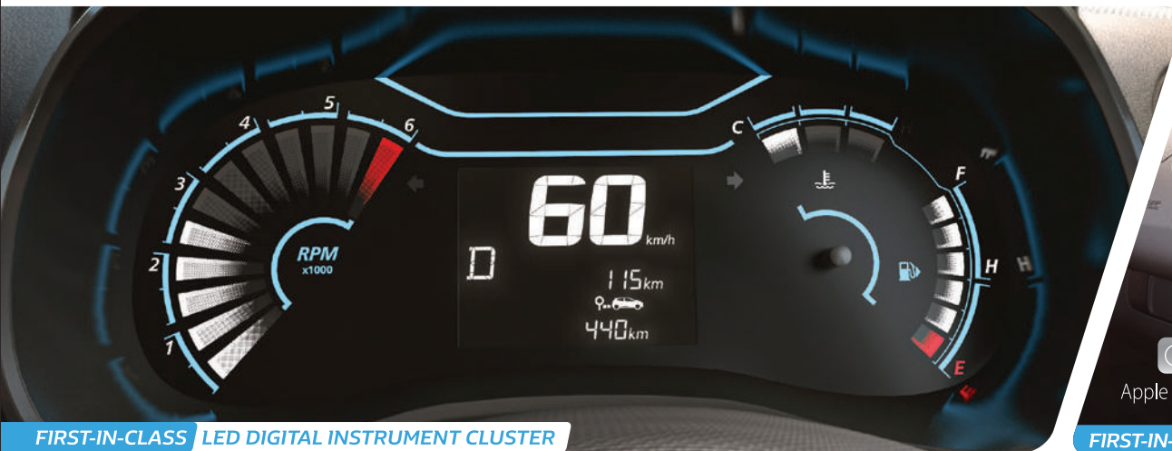
FIRST-IN-CLASS LED DIGITAL INSTRUMENT CLUSTER