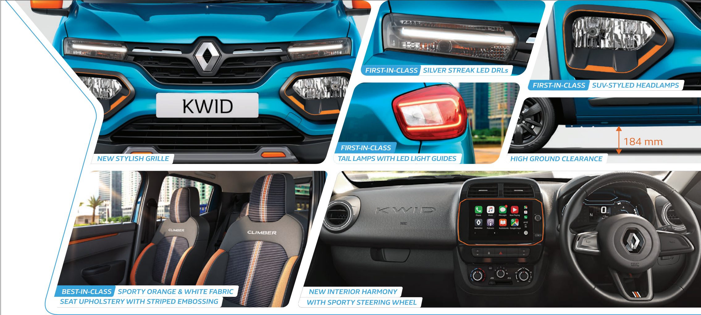
NEW STYLISH GRILLE