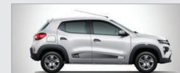
ICE COOL WHITE