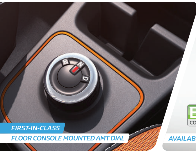
FIRST-IN-CLASS FLOOR CONSOLE MOUNTED AMT DIAL