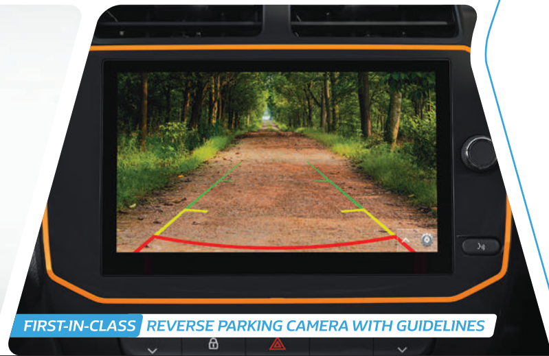
FIRST-IN-CLASS REVERSE PARKING CAMERA WITH GUIDELINES