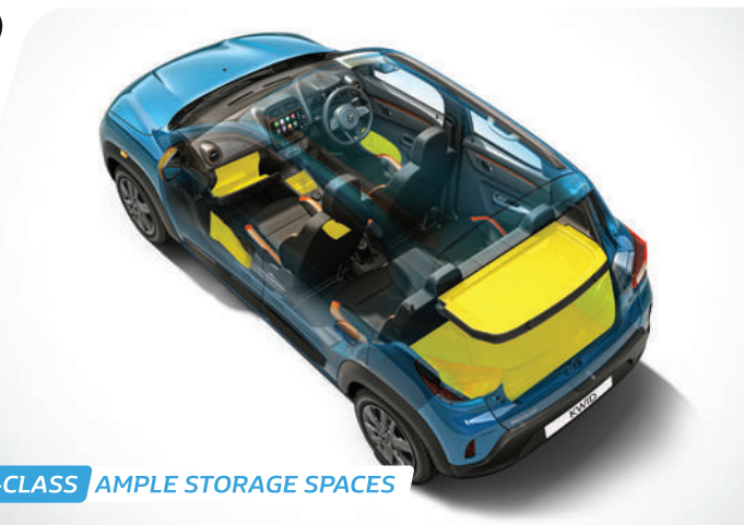
BEST-IN-CLASS AMPLE STORAGE SPACES