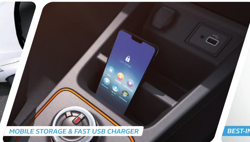
MOBILE STORAGE & FAST USB CHARGER