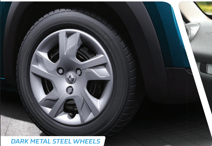
DARK METAL STEEL WHEELS