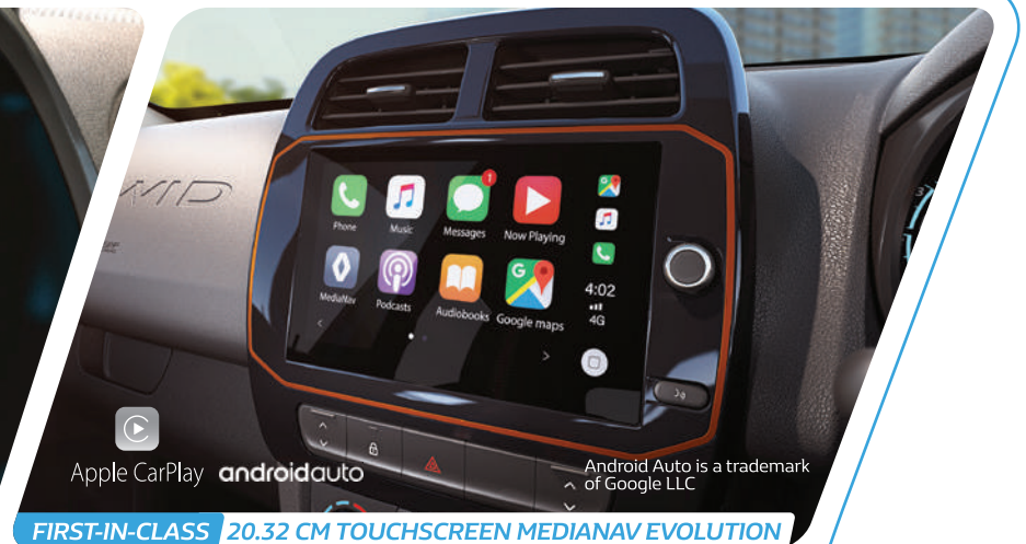
FIRST-IN-CLASS 20.32 CM TOUCHSCREEN MEDIANAV EVOLUTION