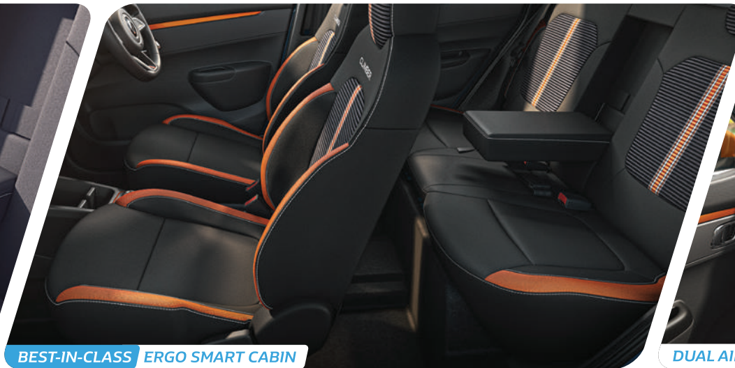
BEST-IN-CLASS ERGO SMART CABIN