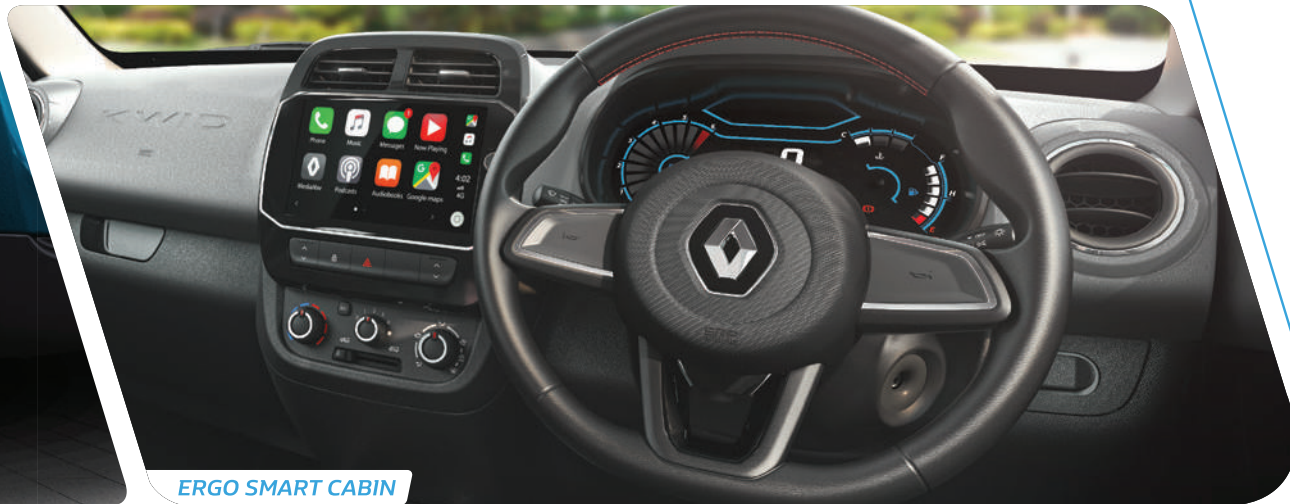
ERGO SMART CABIN