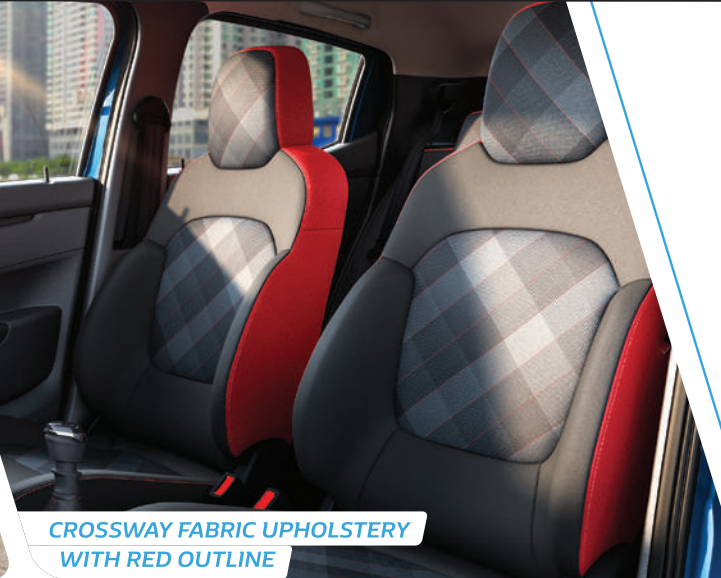
CROSSWAY FABRIC UPHOLSTERY WITH RED OUTLINE